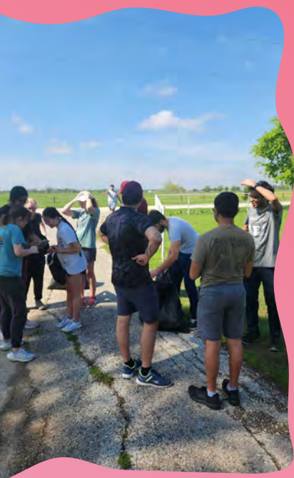
Members at the Big Event site!