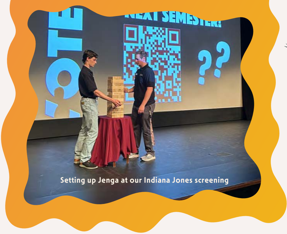
Setting up Jenga at our Indiana Jones screening